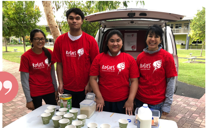
Brisbane Bayside State College

~ Student from Bray Park State High School