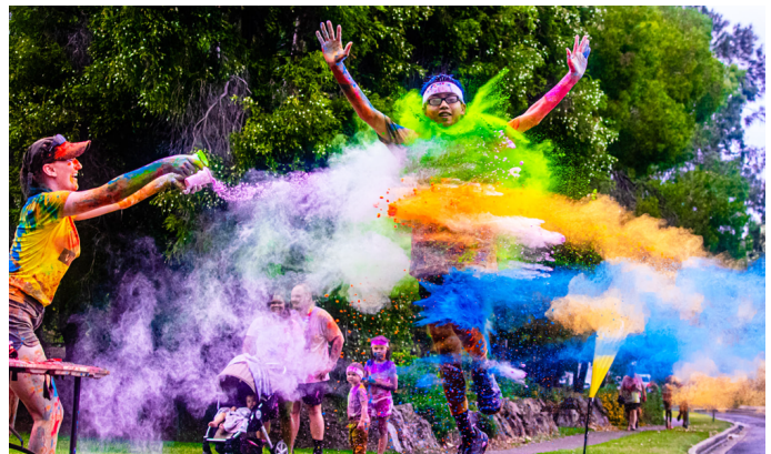
Colour Me Capricorn Gladstone

The student volunteers assisted staff at events based in the Gladstone region including Colour Me Capricorn Gladstone.